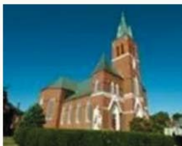
St. Joseph Church 2 School St. Amesbury, MA 01913

Marriage: Arrangements should be made by calling the parish office at least one (1) year in advance for marriage preparations and desired date.