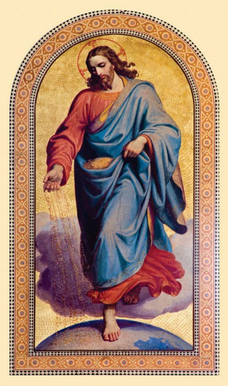
Fifteenth Sunday in Ordinary Time

The seed sown on rich soil is the one who hears the word and understands it, who indeed bears fruit and yields a hundred or sixty or thirtyfold."