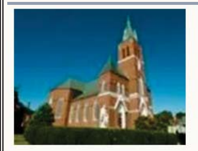
St. Joseph Church 2 School St. Amesbury, MA 01913

Marriage: Arrangements should be made by calling the parish office at least one (1) year in advance for marriage preparations and desired date.