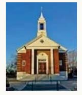
Star of the Sea Town Church September to May 18 Beach St. Salisbury, MA 01952