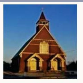
Star of the Sea Beach Chapel Memorial Day to Labor Day 141 North End Blvd. Salisbury, MA 01952