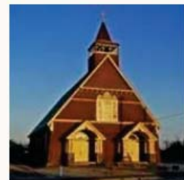
Star of the Sea Beach Chapel Memorial Day to Labor Day 141 North End Blvd. Salisbury, MA 01952