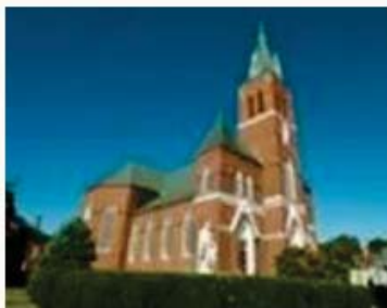
St. Joseph Church 2 School St. Amesbury, MA 01913

Marriage: Arrangements should be made by calling the parish office at least one (1) year in advance for marriage preparations and desired date.