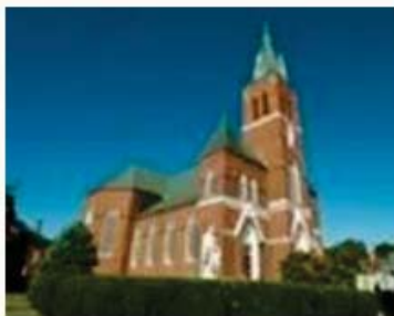
St. Joseph Church 2 School St. Amesbury, MA 01913

Marriage: Arrangements should be made by calling the parish office at least one (1) year in advance for marriage preparations and desired date.