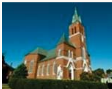
St. Joseph Church 2 School St. Amesbury, MA 01913

Marriage: Arrangements should be made by calling the parish office at least one (1) year in advance for marriage preparations and desired date.