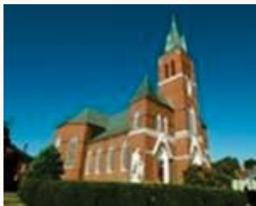
St. Joseph Church 2 School St. Amesbury, MA 01913

Marriage: Arrangements should be made by calling the parish office at least one (1) year in advance for marriage preparations and desired date.