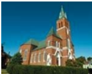
St. Joseph Church 2 School St. Amesbury, MA 01913

Marriage: Arrangements should be made by calling the parish office at least one (1) year in advance for marriage preparations and desired date.