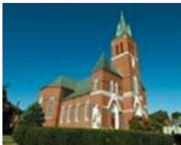
St. Joseph Church 2 School St. Amesbury, MA 01913

Marriage: Arrangements should be made by calling the parish office at least one (1) year in advance for marriage preparations and desired date.