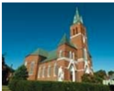
St. Joseph Church 2 School St. Amesbury, MA 01913

Marriage: Arrangements should be made by calling the parish office at least one (1) year in advance for marriage preparations and desired date.