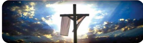
Alleluia - Alleluia

Please join us on Saturday May 4 th at 7:30 p.m. or Sunday, May 5 th at 4:00 p.m. at Pentucket Regional High School's spacious new auditorium in West Newbury for an inspiring concert of some of the most passionate choral music ever written celebrating the resilience of the human spirit and the redeeming power of hope . The performance features Maurice Duruflé's glorious and ethereal Requiem , and music of 20th and 21st Century female composers from the U.S. and abroad. The chorus will be accompanied by an 18-piece orchestra, including strings, trumpets, timpani, harp, piano and organ. For details and tickets, go to newburyportchoralsociety.org