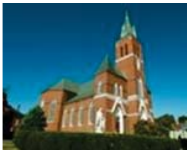
St. Joseph Church 2 School St. Amesbury, MA 01913

Marriage: Arrangements should be made by calling the parish office at least one (1) year in advance for marriage preparations and desired date.