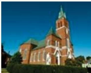
St. Joseph Church 2 School St. Amesbury, MA 01913

Marriage: Arrangements should be made by calling the parish office at least one (1) year in advance for marriage preparations and desired date.