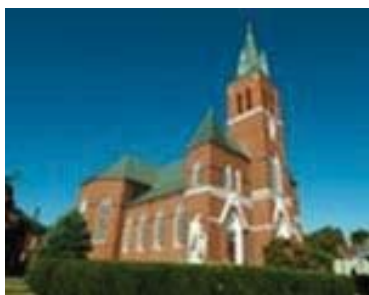
St. Joseph Church 2 School St. Amesbury, MA 01913

Marriage: Arrangements should be made by calling the parish office at least one (1) year in advance for marriage preparations and desired date.