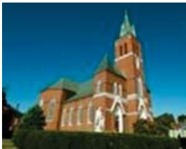
St. Joseph Church 2 School St. Amesbury, MA 01913

Marriage: Arrangements should be made by calling the parish office at least one (1) year in advance for marriage preparations and desired date.