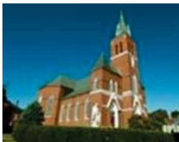
St. Joseph Church 2 School St. Amesbury, MA 01913

Marriage: Arrangements should be made by calling the parish office at least one (1) year in advance for marriage preparations and desired date.