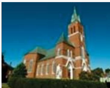
St. Joseph Church 2 School St. Amesbury, MA 01913

Marriage: Arrangements should be made by calling the parish office at least one (1) year in advance for marriage preparations and desired date.