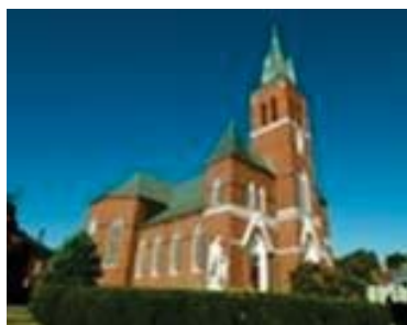
St. Joseph Church 2 School St. Amesbury, MA 01913

Marriage: Arrangements should be made by calling the parish office at least one (1) year in advance for marriage preparations and desired date.