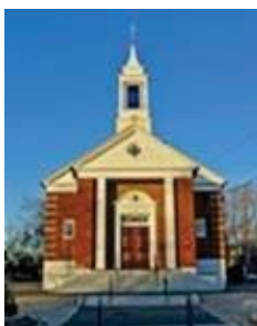
Star of the Sea Town Church October thru May 18 Beach Rd. Salisbury, MA 01952