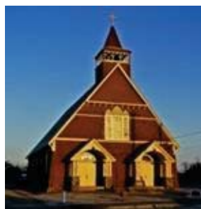
Star of the Sea Beach Chapel Memorial Day thru Columbus Day 141 North End Blvd. Salisbury, MA 01952