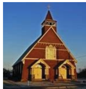
Star of the Sea Beach Chapel Memorial Day thru Columbus Day 141 North End Blvd. Salisbury, MA 01952