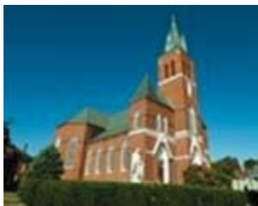
St. Joseph Church 2 School St. Amesbury, MA 01913

Marriage: Arrangements should be made by calling the parish office at least one (1) year in advance for marriage preparations and desired date.